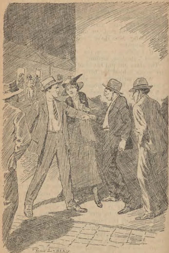
Then, with a "Hands off, Rip! Go easy, man!" he freed the girl's arm from the other's grasp.