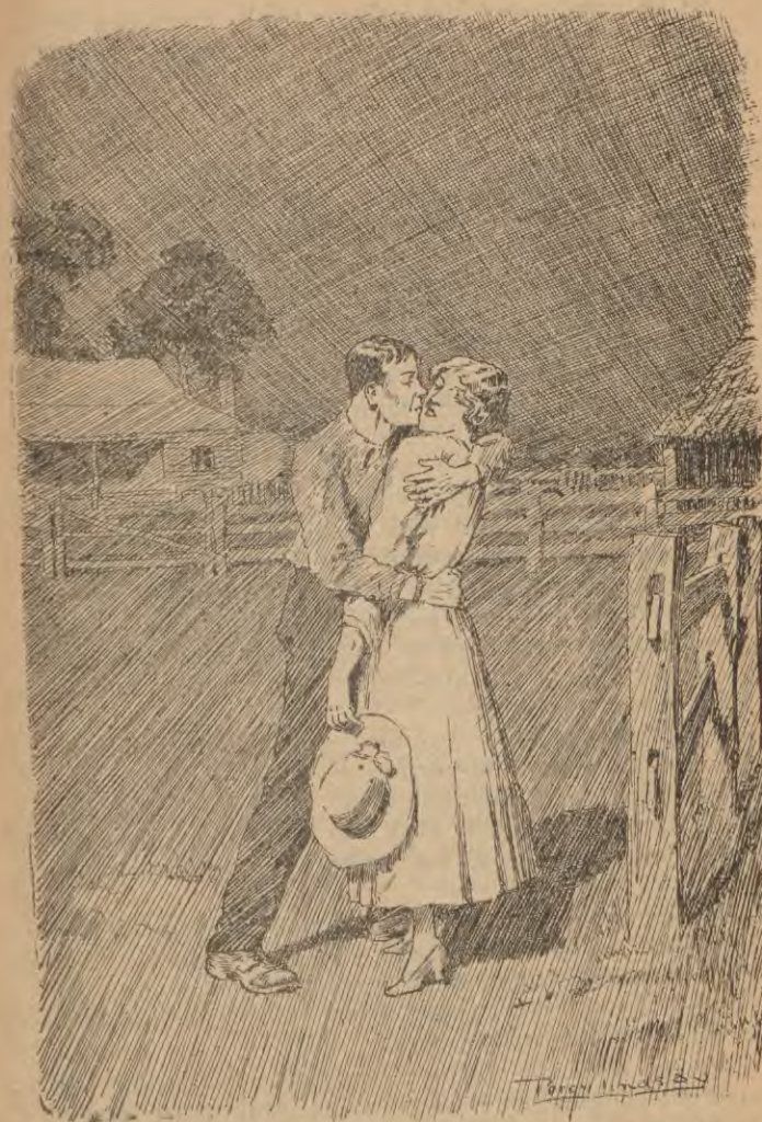
But she could say no more, and the next instant Amery had her in his arms. Equality Road.