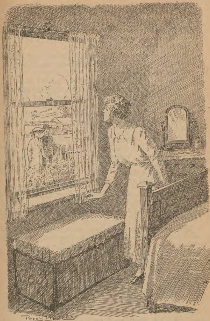
Valentine's lips parted, her eyes widened, and remained fixed, and, for one instant she stood motionless.

When they were leaving, a sudden inspiration came to Mrs. Blake, and she directed them to the cottage. "It's a minister's duty, isn't it?" she said, when telling the Reverend gentleman of the couple at the cottage. "I do not know to what denomina-