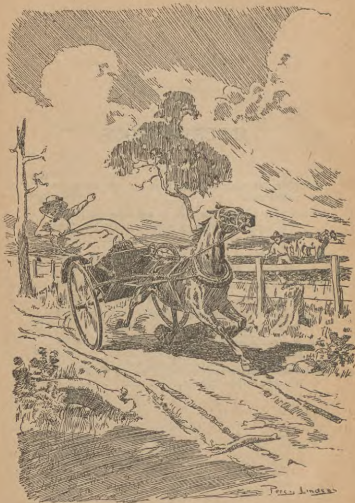
Valentine was flung violently from her seat on to the rough track. Equality Road. (See page 17.)