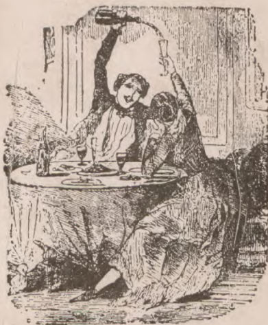
The poor Barmaid having a little bit of supper after her hard day's work.