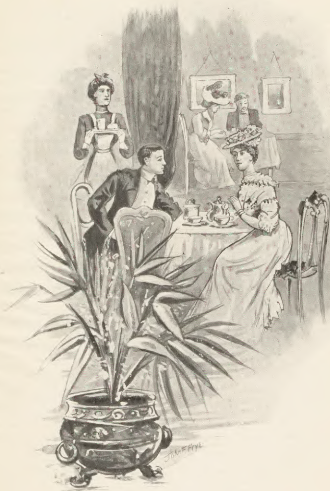
"What a little diplomat you are!"

"Mind what? the tea or the fever?" Madge asked teasingly.